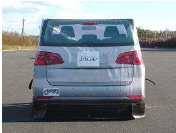
Attached 1 – Vehicle Target outward appearance

The number plate of the Vehicle Target displays the JNCAP logo. The air pressure of the Vehicle Target should be set to 25 kPa and this air pressure should be maintained during the test.