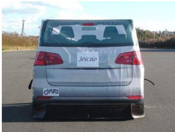
Attached 1 – Vehicle target outward appearance

The number plate of the test vehicle displays the JNCAP logo. The air pressure of the vehicle target should be set to 25 kPa and this air pressure should be maintained during the test.