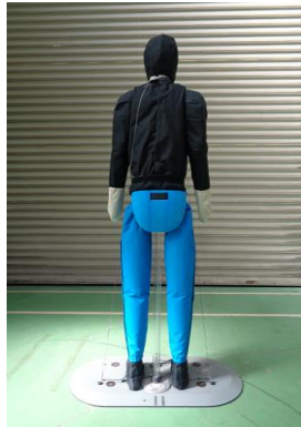
Attached 2 – Pedestrian target outward appearance